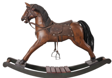
wooden rocking horse