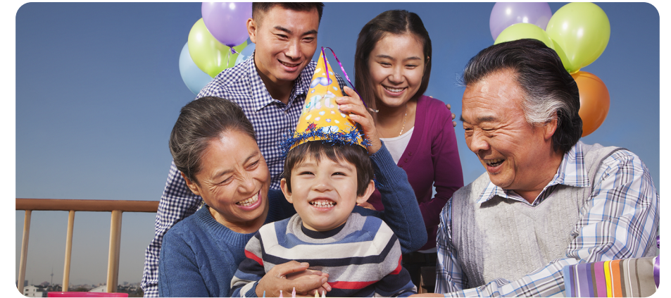
Birthdays happen every year.

Important life events include birthdays, religious festivals or family celebrations. Some life events happen every year and some happen at certain stages of human life.