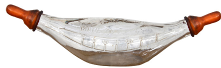
Victorian baby bottle

An artefact is an object from the past. Museums often display historical artefacts. Artefacts can tell us about how people used to live. Everyday objects like baby bottles, clothing, toys and books can tell us about childhood in the past.