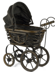
wood and metal pram