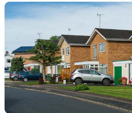
A street today.