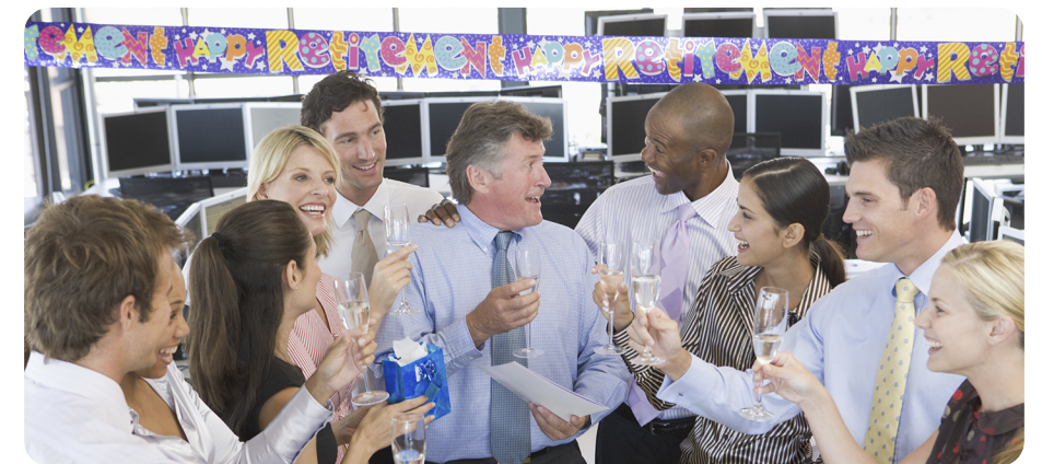
Retirement happens when an elderly person leaves work.