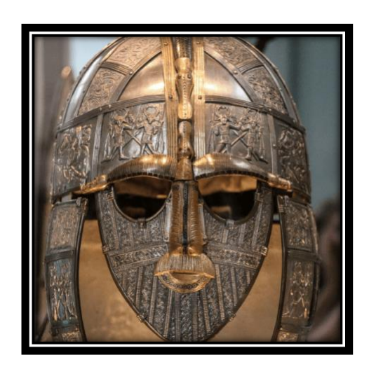
YEAR 4 AUTUMN 2